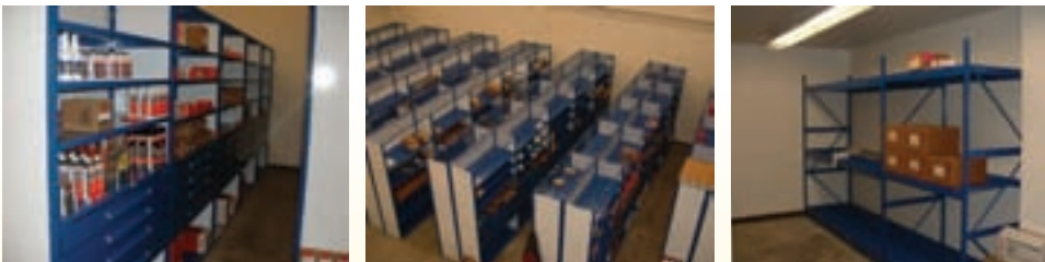
Mike W., parts manager

"Equipto V-Grip™ shelving is a great product. We especially like the modular drawers in the shelving that we use for storage of small parts. Everything went smooth with the installation and we are very happy with the end result"