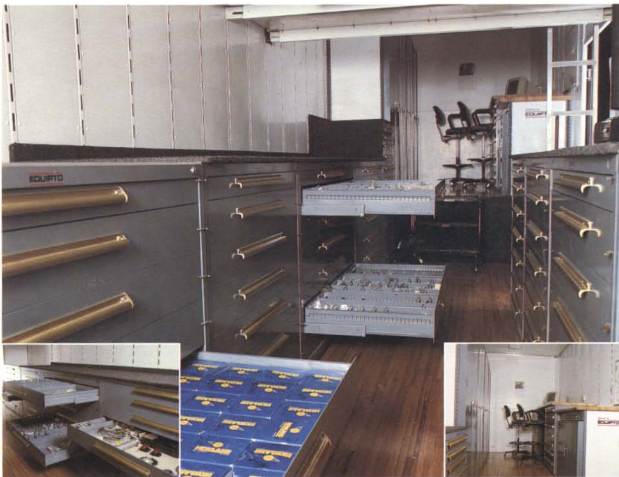
Equipto cabinets installed in Carl Haas tractor trailers years ago are still in use today. Durability is a major factor in auto racing supply. Equipto systems have performed flawlessly under these rigorous demands.