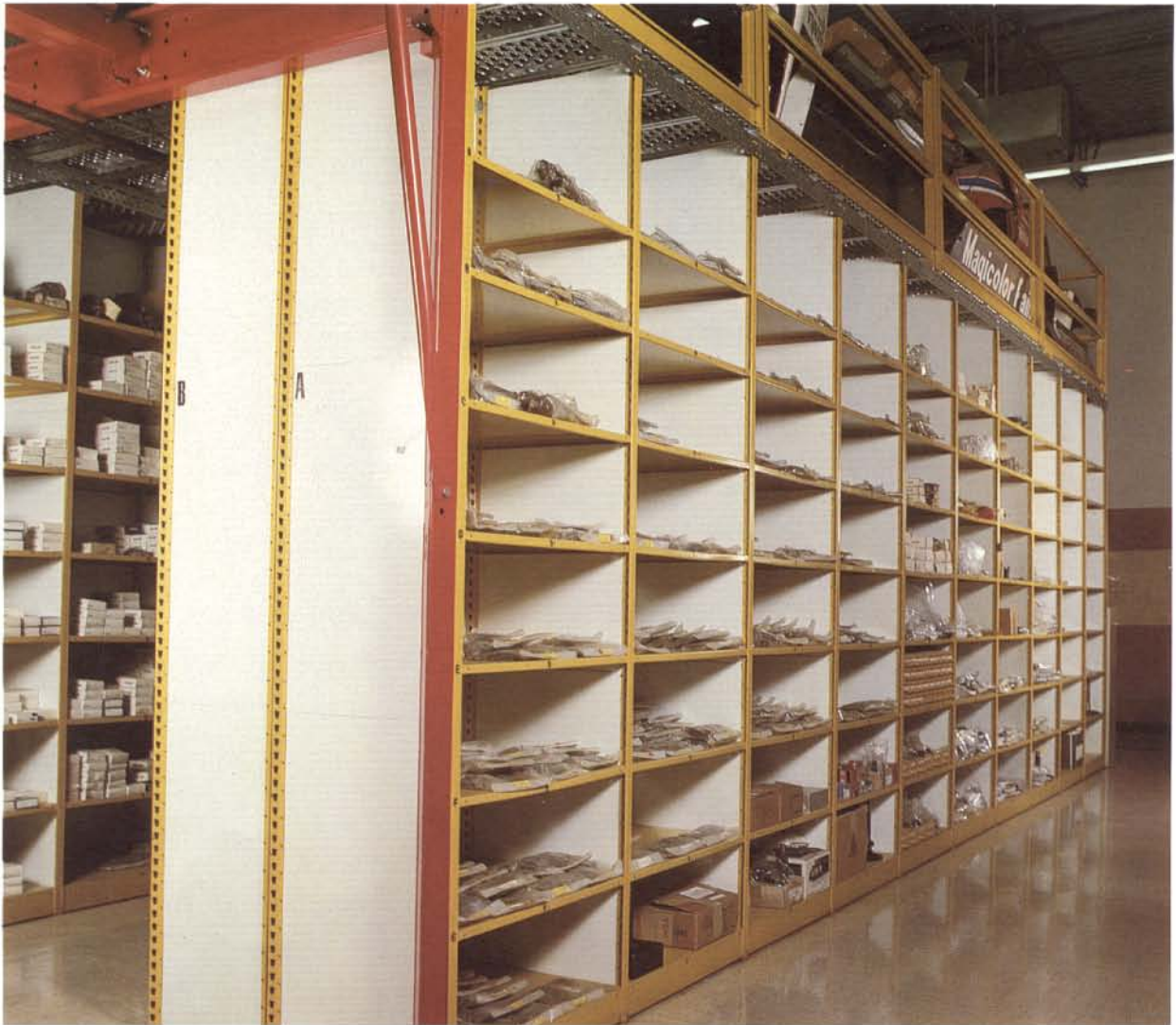
Automotive supply requires versatility in a space utilization system. That's what Carl Haas got with Equipto.

CUSTOM COLORS • SPACE UTILIZATION PLANNING • CARTS • MODULAR DRAWER CABINETS • PALLET RACK • V-GRIP SHELVING • MEZZANINES • CABINETS