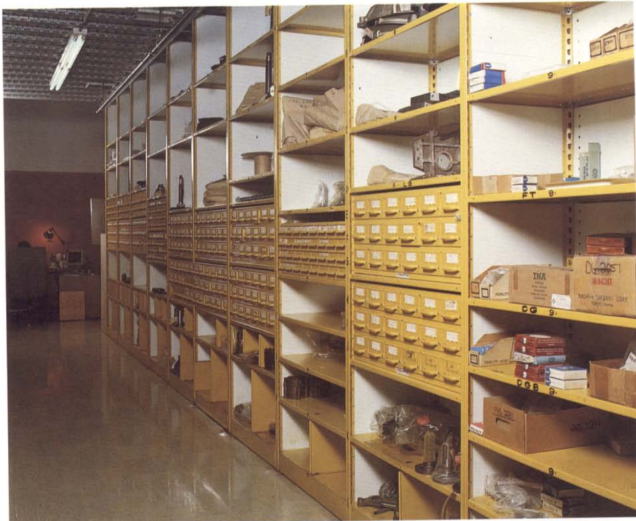
Equiptovation has helped Carl Haas Racing stay in the fast lane by effectively utilizing storage space.

CUSTOM COLORS • SPACE UTILIZATION PLANNING • CARTS • MODULAR DRAWER CABINETS • PALLET RACK • V-GRIP SHELVING • MEZZANINES • CABINETS