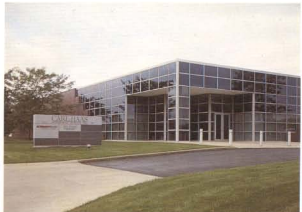
Located just outside Chicago, Carl Haas has 40 employees and a building with over 32,000 sq. ft.