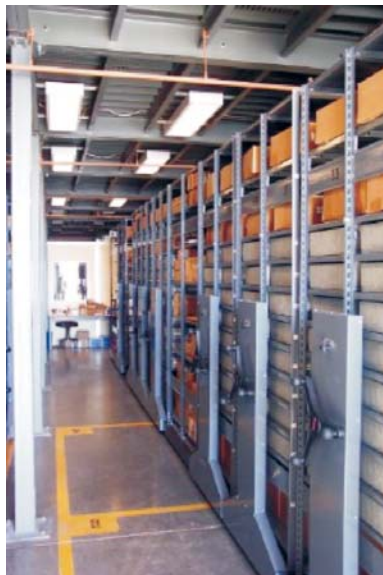
Economical, open-style drive column's give clear visibility into the items being stored on Mt. Home AFB's Mobile Aisle System.