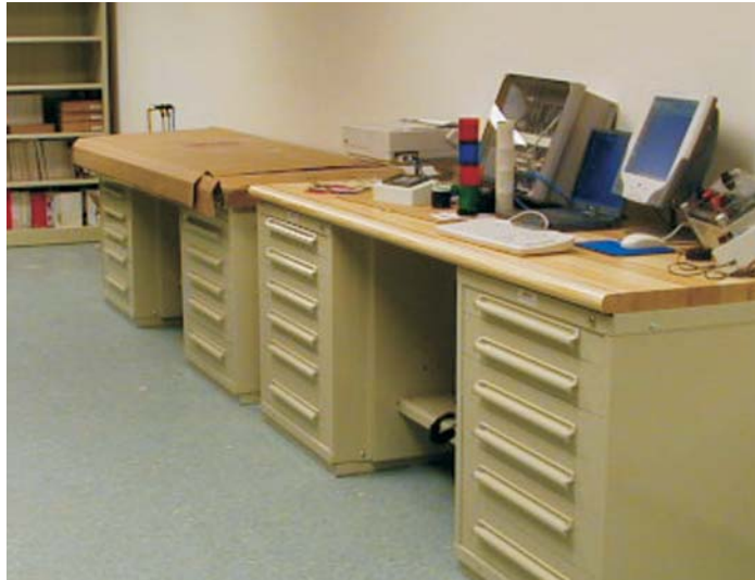
Modular Drawer Cabinet workcenters provide work and storage space in the communications department at the Orange County Fire Department in CA.

Equipto workcenters provide years of useful, rugged and efficient space utilization. Select from wall-mount or free-standing units, with or without drawers, and the largest variety of accessories to take advantage of your work space. Equipto's extensive line of workcenters organize work areas and productivity.