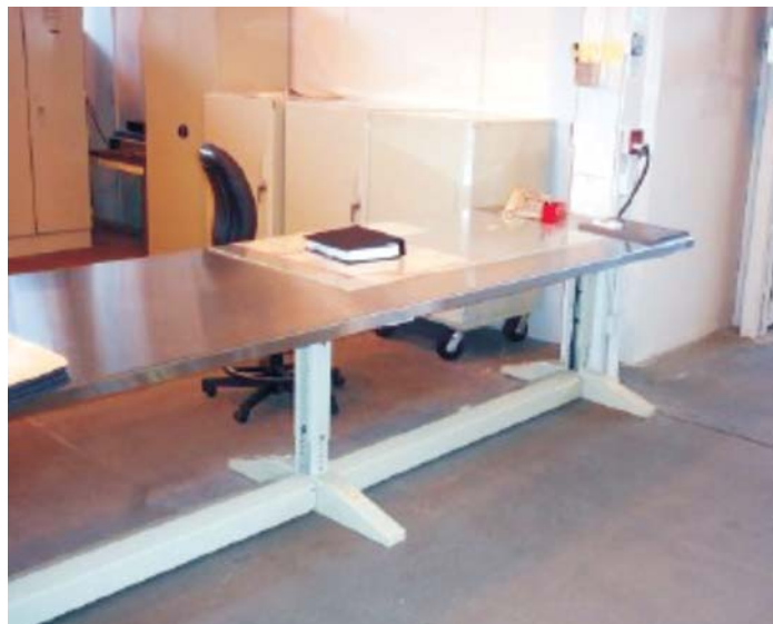
"Iron-I" workcenters with stainless steel tops provide a clean, attractive work space for an avionics repair department at McChord AFB.