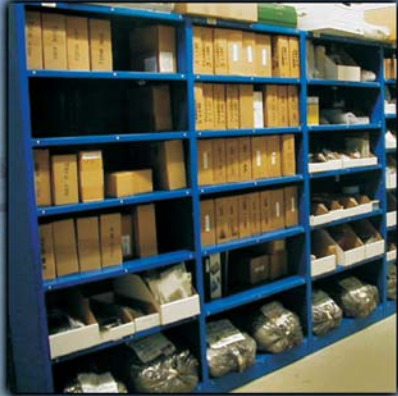
SHELVING AND RACKS