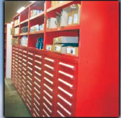
MODULAR DRAWER CABINETS