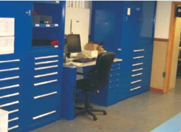
At Elmendorf AFB in Anchorage, AK, Modular Drawer Cabinets with upper shelving cabinets organize electronic parts and avionic components for the F-15 Boeing training facility.

Organize small avionic parts, maintenance tools and equipment, and department supplies with Modular Drawer Cabinets. Each Equipto Modular Drawer Cabinet is engineered and manufactured with exacting precision for years of rugged use. Mobility kits and a wide selection of worksurfaces create flexible, transportable custom work areas.