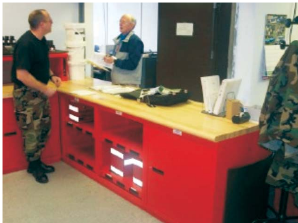
At McChord AFB, Modular Drawer Cabinets are configured with roll-out shelves, flush-mount locking doors, and solid hardwood tops to provide secure storage for a tools issue counter at the sheet metal shop for the 62nd Maintenance Squadron.