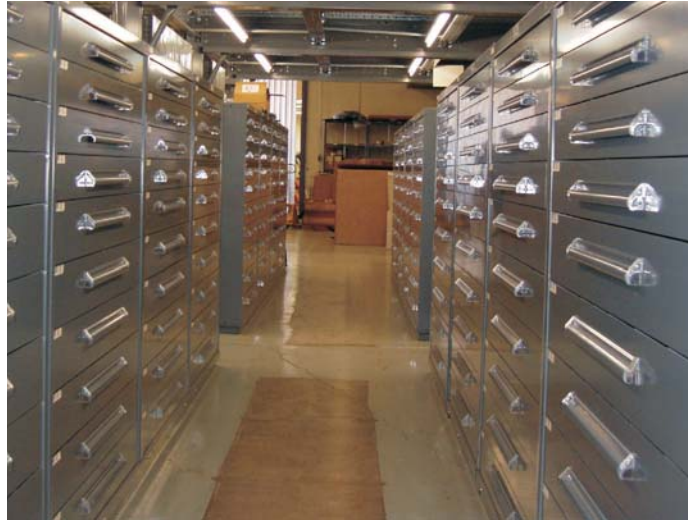
Modular Drawer Cabinets offer self-contained storage for small to medium parts and can be easily repositioned without unloading for facility reconfiguration or deployment.