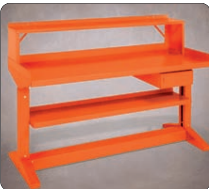
BENCH WITH LOWER SHELF, AERIAL SHELF AND DRAWER.