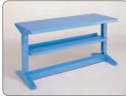
IRON-I BENCH WITH LOWER SHELF 424D6