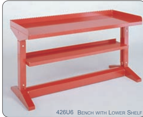
426U6 BENCH WITH LOWER SHELF