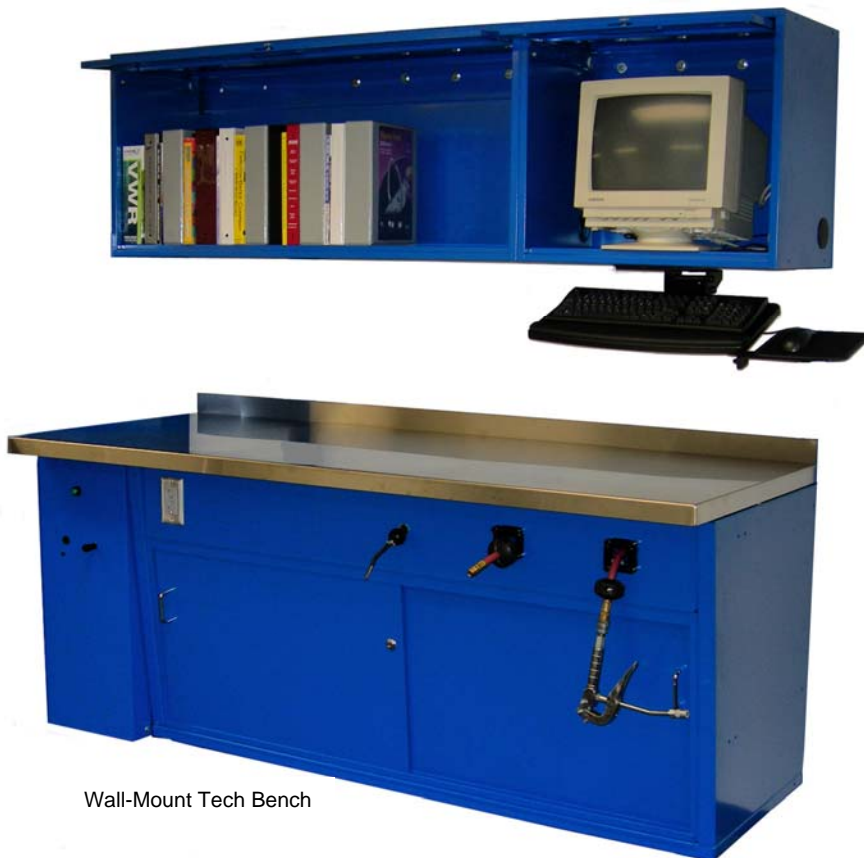
Wall-Mount Tech Bench

Image sells cars and it also sells the places customers take those cars to be serviced. Equipto's Automotive Tech Benches are designed to enhance the professional image of your service center by giving it a clean, organized, high-tech appearance that caters to the sophisticated tastes of today's customers and the equipment needs of your service technicians.