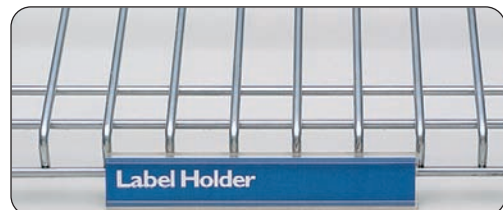
EQUIPTO LABEL HOLDER IS A NEAT AND EASY WAY TO IDENTIFY RECORDS OR SUPPLIES. PART No. 6620.

STANDARD COLOR - OFFICE GRAY. COLOR COORDINATING? REFER TO EQUIPTO COLOR CHART - INSIDE REAR COVER.