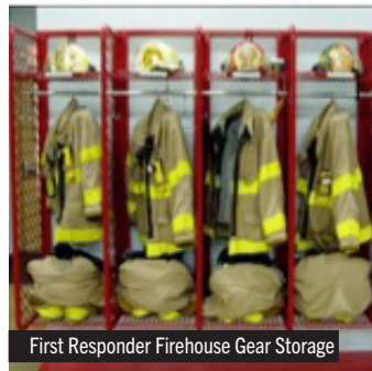
First Responder Firehouse Gear Storage