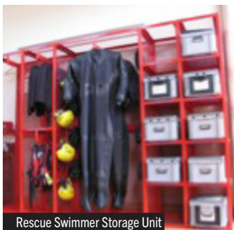
Rescue Swimmer Storage Unit