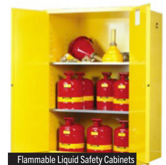
Flammable Liquid Safety Cabinets