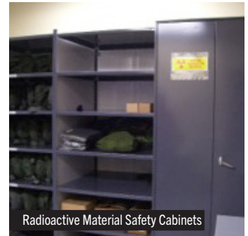
Radioactive Material Safety Cabinets