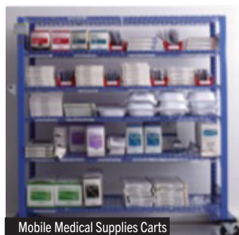
Mobile Medical Supplies Carts