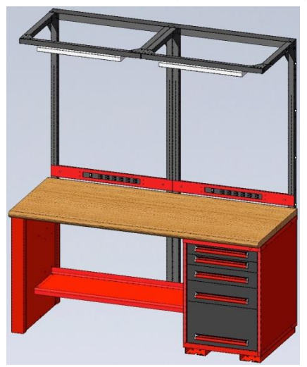
OV6-CLD * 30"D x 72"W x 84"H (Desk 35-1/8"H)