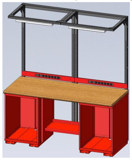
OV6-CCD * 30"D x 72"W x 84"H (Desk 35-1/8"H)